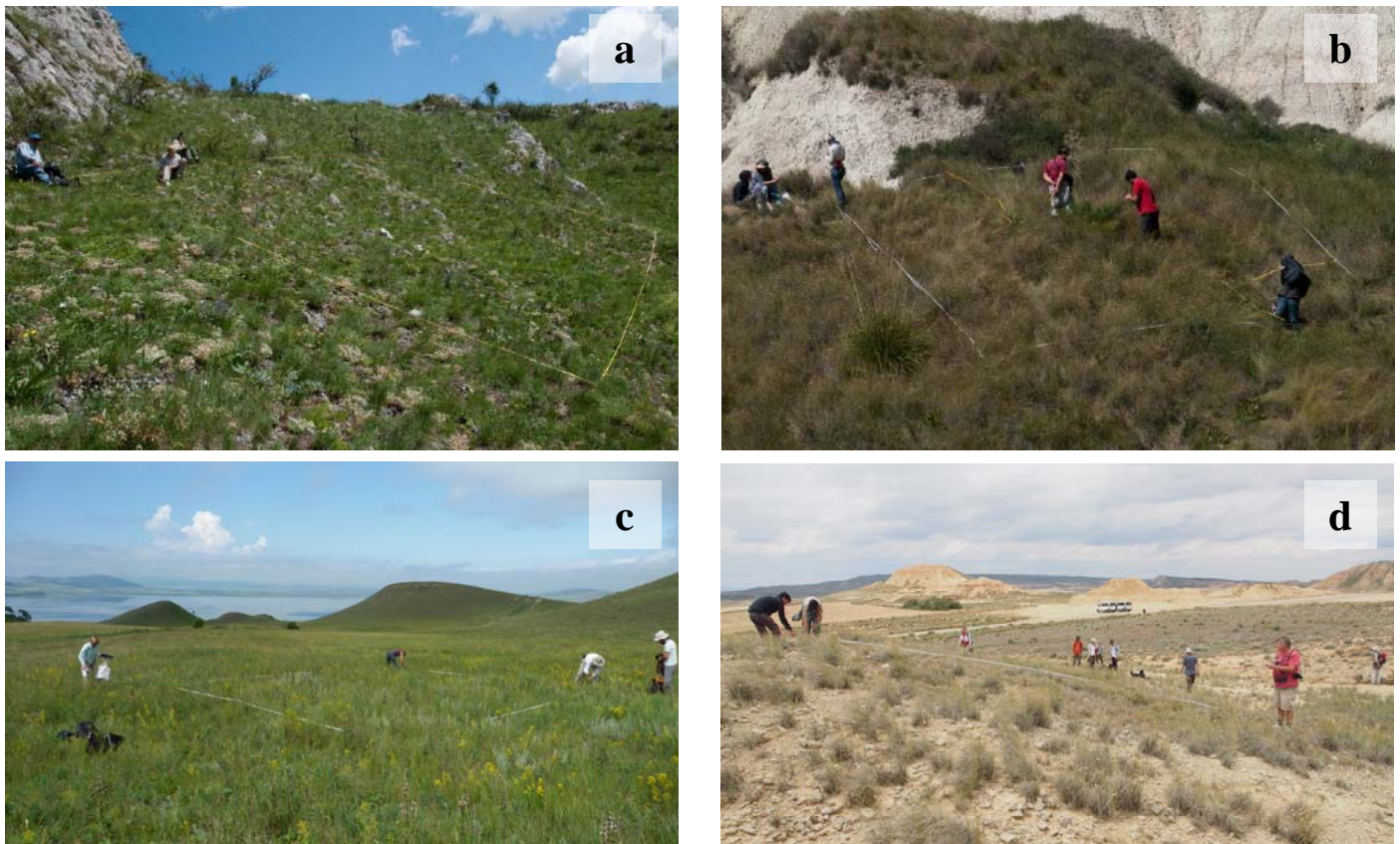
Fig. 1: Photos showing multi-scale plant diversity sampling in different Palaeartic grasslands: (a) 1st EDGG Research Expedition 2009 in Transylvania (Photo: J. Dengler); (b) 4th EDGG Research Expedition 2012 in Sicily (Photo: J. Dengler); (c) 6th EDGG Research Expedition 2013 in Khakassia (Photo: M. Janišová); (d) 7th EDGG Field Workshop 2014 in Navarre (Photo: M. Janišová).

naturally species-poor subtypes (e.g. Chytrý 2001). Therefore, we base the overview provided here on sampling schemes that were specifically devoted to study diversity patterns, i.e. where we assume that researchers precisely delimited the plots and very thoroughly sampled them in order not to overlook some species that occur only with few tiny non-flowering individuals, which can contribute significantly to a plot's species richness. Since species richness increases with plot size, our aim was to compile data for a wide range of different plot sizes, ranging from 1 cm 2 to 100 m 2 . The overview provided here builds on previous compilations of some of the authors (Dengler 2005; Kuzemko et al. 2016). It is the so far most comprehensive reference database of such information, although we certainly missed many relevant datasets. We thus hope that this overview spurs others to contribute their already existing data for future updates or to collect new data with similar protocols in grassland types and regions that are still missing in our overview.