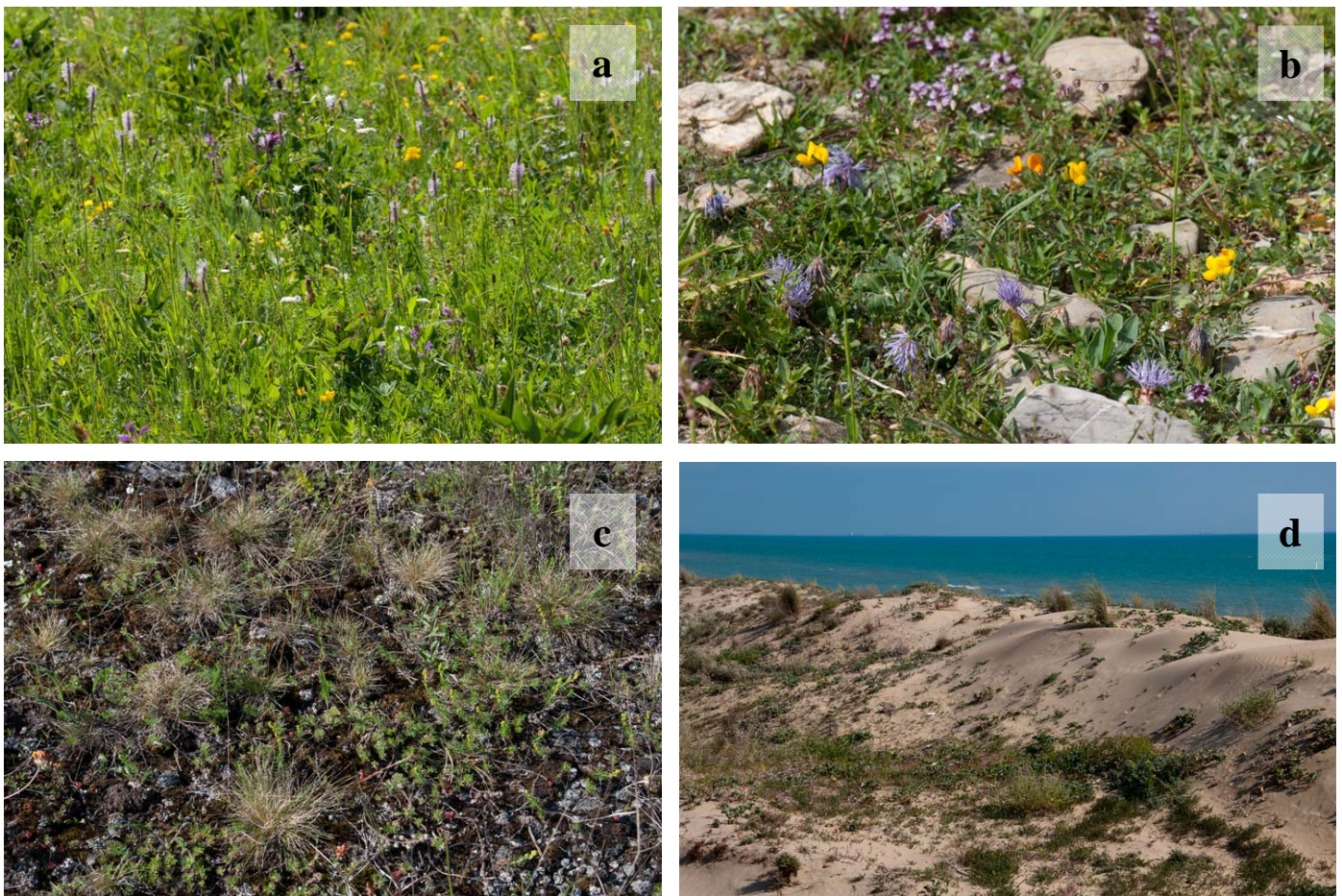
Fig. 3: Photos showing Palaeartic grasslands that are extreme for certain aspects of plant diversity. (a) World record stand for 0.1-m 2 and 10-m 2 vascular plant species richness (43 and 98 species, respectively) (Transylvania, Romania: Cirsio-Brachypodium pinnati , Festuco-Brometea ); (b) new world record stand for 0.001-m 2 vascular plant richness (19 species, Belagua at 939 m a.s.l., Navarre, Spain: intensively grazed, Potentillo-Brachypodium pinnati , Festuco-Brometea ); (c) stand of the Tortello tortuosae-Sedion albi , Sedo-Scleranthenea , the Palaeartic grassland type richest in non-vascular plants at all considered spatial scales with e.g. up to 64 species on 9 m 2 (the photo is from Saaremaa, Estonia, while stands in Öland, Sweden, are known to be slightly richer); (d) dune grassland (Sicily, Italy: Alkanno-Malcolmion parviflorae , Tuberarietea guttatae ), which is among the poorest types in our overview in terms of vascular plant species richness, with e.g. only 13 species on 100 m 2 (Photos: J. Dengler).

(i.e. terricolous vascular plants, bryophytes, lichens and macro -“algae”), non-vascular plant species richness, and percentage of non-vascular plants (non-vascular plant species richness / total species richness). For the sake of linguistic convenience, we include lichens in the following under the generic term “plants”, acknowledging that they actually are symbioses between fungi and photo-autotrophic partners. The data published here as tables, can be requested from the corresponding author in spread sheet format.